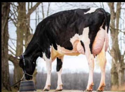
DAM : KARNVILLA DL SONATA VG-86