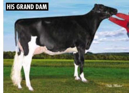
LINDENRIGHT BRADNICK MOOVIN ON VG-87 34★ 04-06 17,388kgM 5,3%F 918F 3,4%P 598P