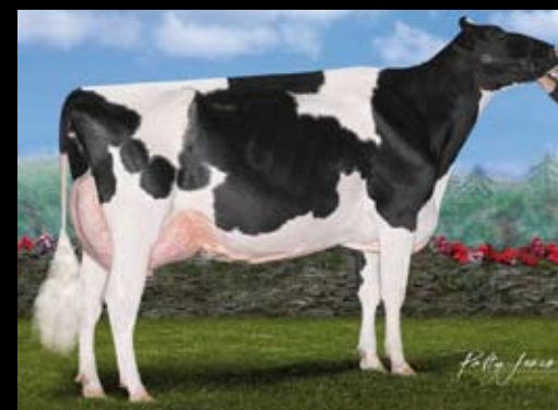
MGD : AVANT-GARDE DM SONGBIRD VG-89 2★

SIRE : STANTONS ALLIGATOR VG-85 DAM : KARNVILLA DL SONATA 101 VG-86 MGS : FARNEAR DELTA-LAMBDA MGD : AVANT-GARDE DM SONGBIRD VG-89 2★ MGGs : VAL-BISSON DOORMAN EX-90 MGGD : WALNUTLAWN MCCUTCHEEN SUMMER EX-95 11★ 4 TH : MISTY SPRINGS LAVANGUARD SUE VG-89 13★ 5 TH : MISTY SPRINGS FBI SUZANNE VG-87 4★ 6 TH : WILLSONA FREELANCE SIZZLE VG-86 10★ 7 TH : GEN-I-BEQ CONVINCER SILVER VG-88 16★ 8 TH : GLEN DRUMMOND SPLENDOR VG-86 39★ 9 TH : GLEN DRUMMOND AERO FLOWER VG-88 18★ 10 TH : GLEN DRUMMOND SHOWER EX 14★