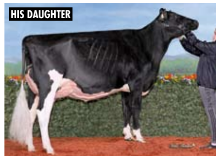
GAELANDE THE LUX ROSE NOIRE VG-86