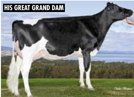
LINDENRIGHT GOLDWYN MYSTICAL EX-91 6★ 07-05 13,161kgM 5,0%F 658F 3,5%P 463P