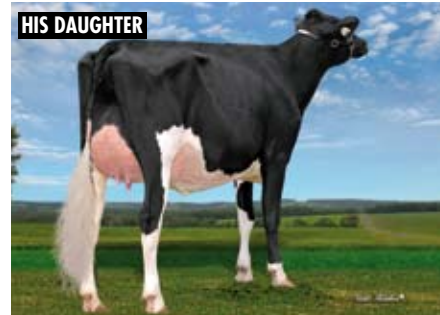
MILBRO KICK DE LUX BRENIE VG-87 2YR