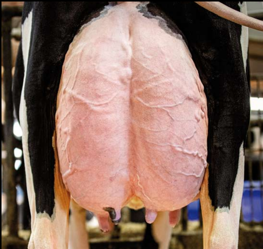
DAM : KARNVILLA DL SONATA VG-86