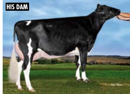
LINDENRIGHT SUPERMAN MOOLA EX-90 2★ 05-00 16,012kgM 4,0%F 641F 3,3%P 533P

4 TH EASTSIDE LEWISDALE DUNDEE ABEL EX-92 22★ 5 TH STADACONA OUTSIDE ABEL VG-88 38★ 6 TH STADACONA PROGRESS ANIBEL VG-85 2★